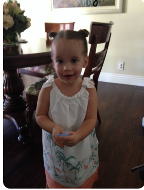
toddler (idk age)