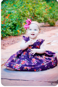
6 ish months