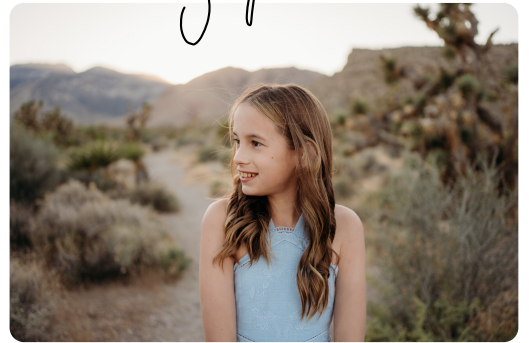
2023 family photos